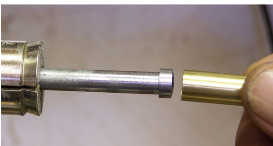
Now file down the bolt head so that the tube just slips over