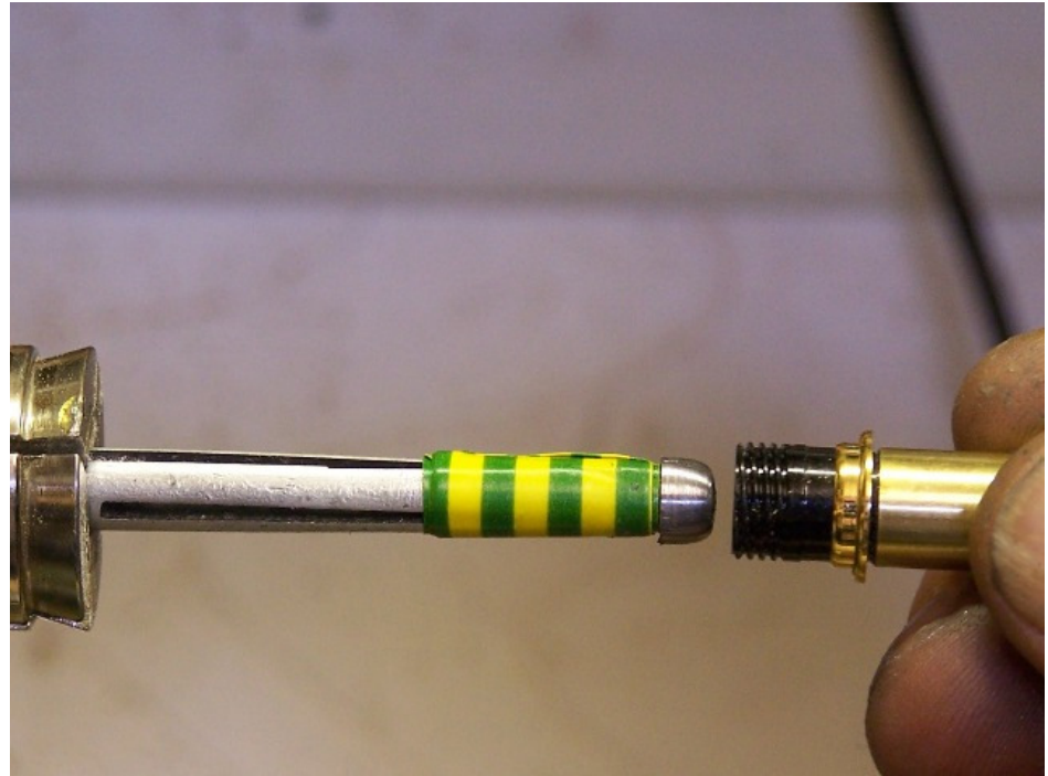
With a little tape, squeeze all the tips together. Now round over the tip and file the diameter down till it fits through the coupler smoothly