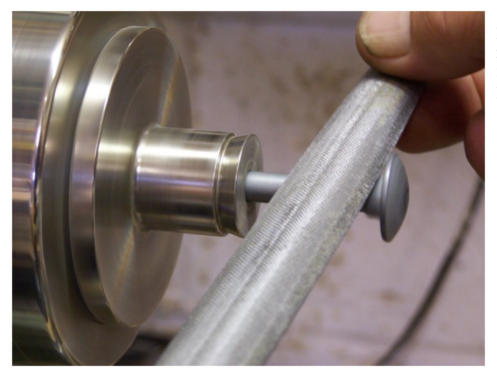
Hold the file handle in your left hand and remove the square portion