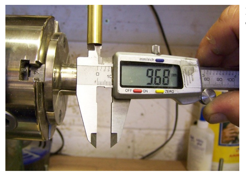
Measure the inside of the pen tube