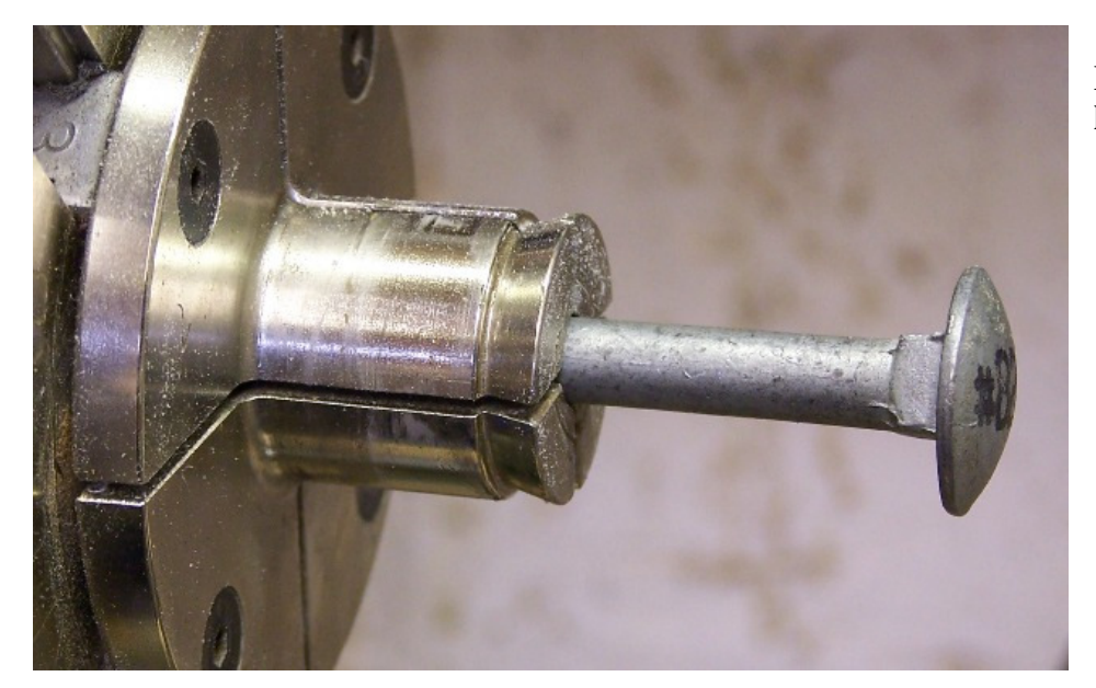
Mount the bolt in the lathe