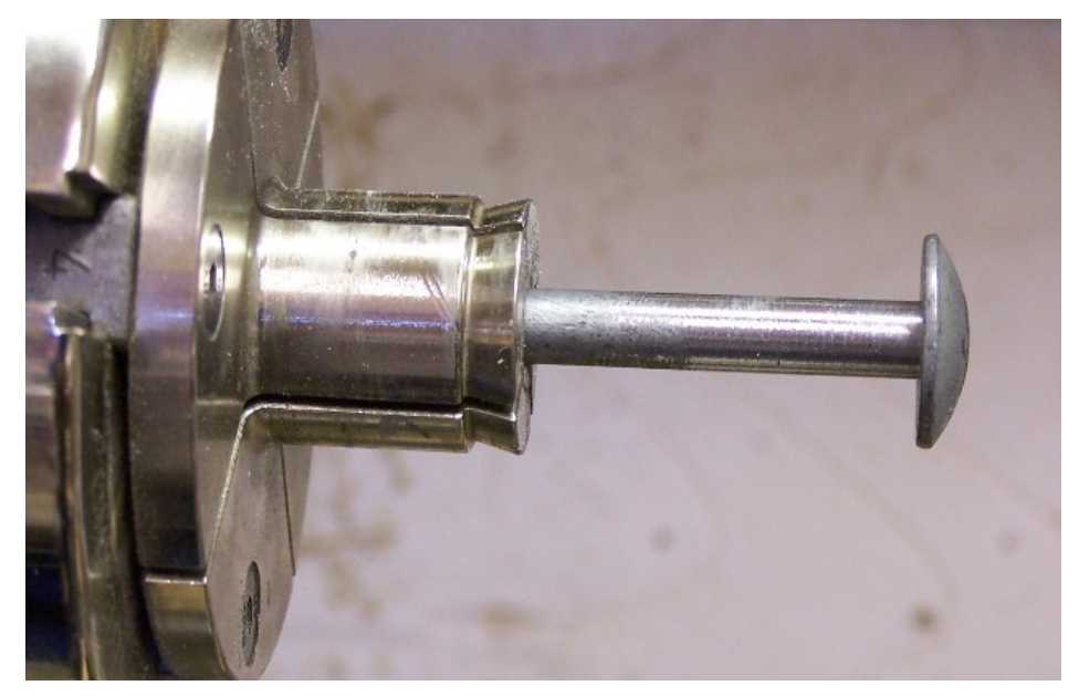
Square portion cleaned off