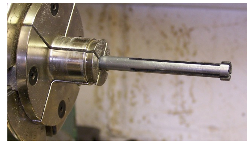
Cut two slots with a hacksaw about 50mm long. Try and keep them straight but it's not critical if they wave a bit